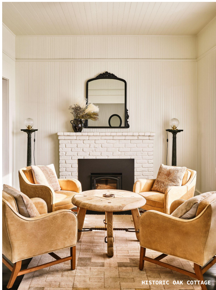
HISTORIC OAK COTTAGE