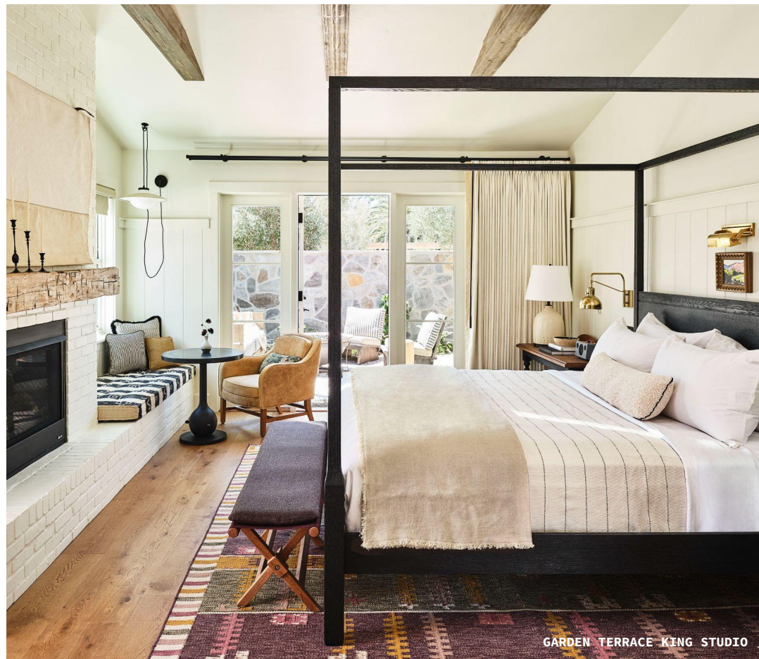
GARDEN TERRACE KING STUDIO