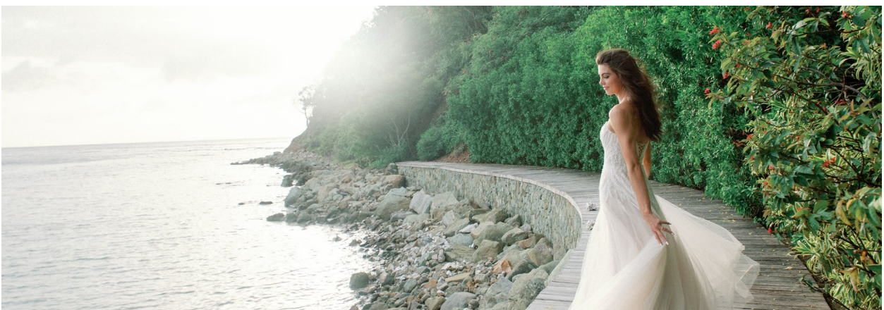
L'Ance Guyac Available for events for up to 60 guests