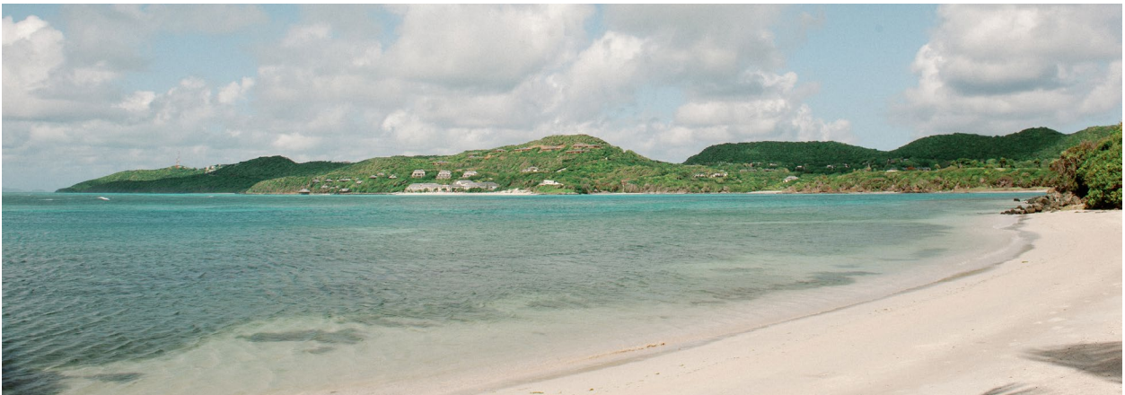
Shell Beach Available for events for up to 70 guests