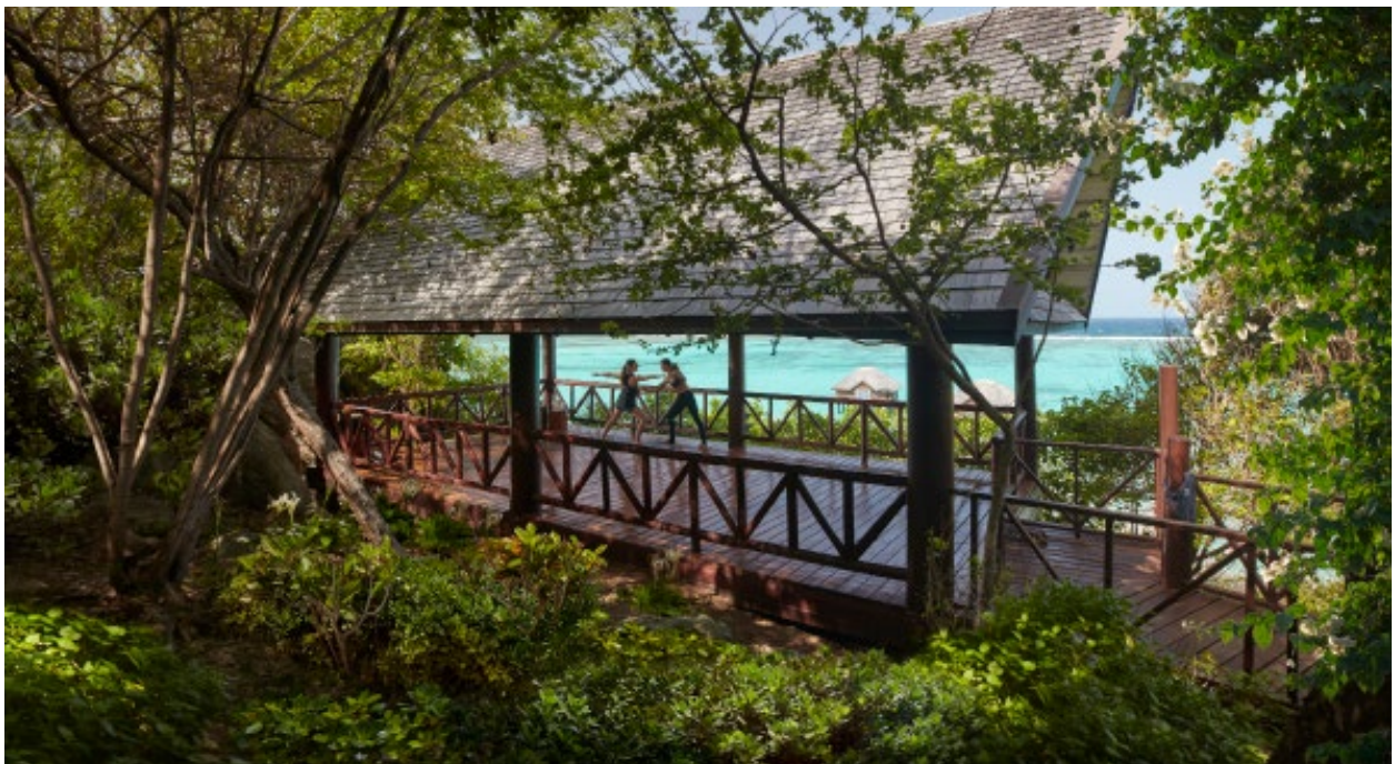
The Spa's meditation pavilion is an inspiring, tranquil open-air space for yoga and meditation.