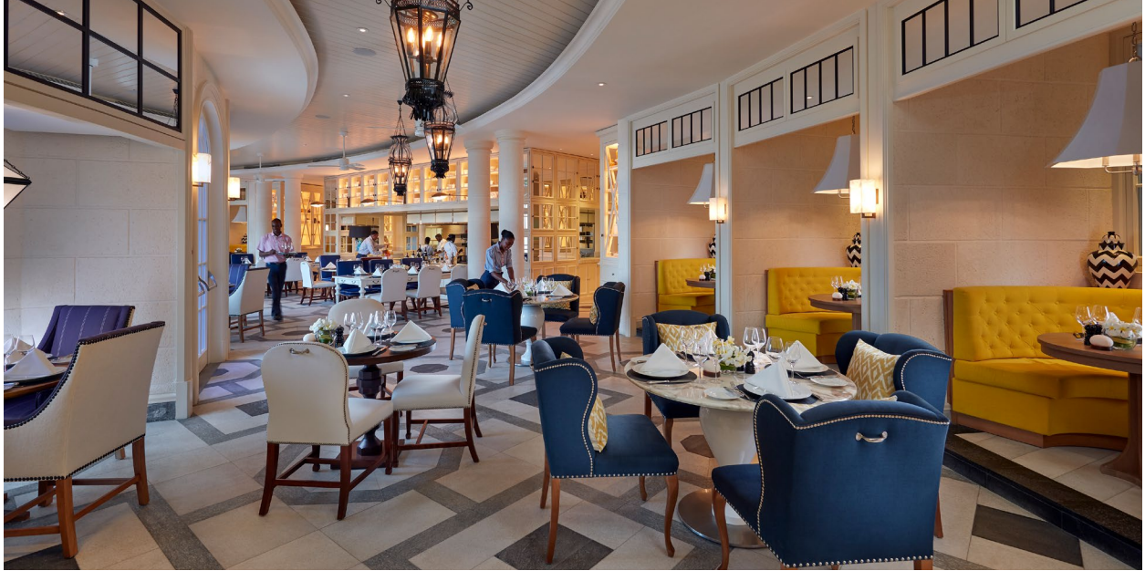
Asianne Restaurant Available for events for up to 80 guests