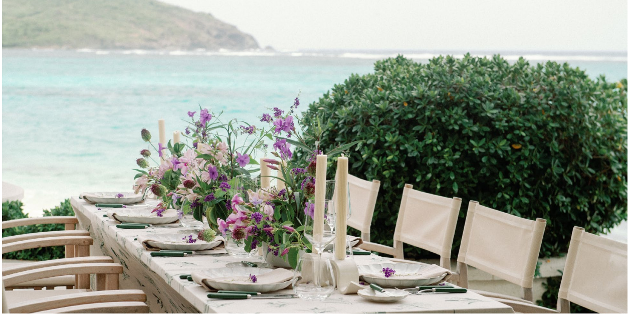
Lagoon Cafe Available for events for up to 38 guests