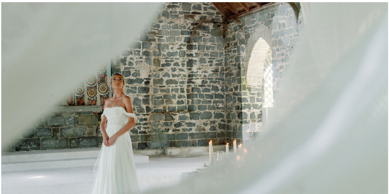
17th Century Church Available for ceremonies for up to 80 guests