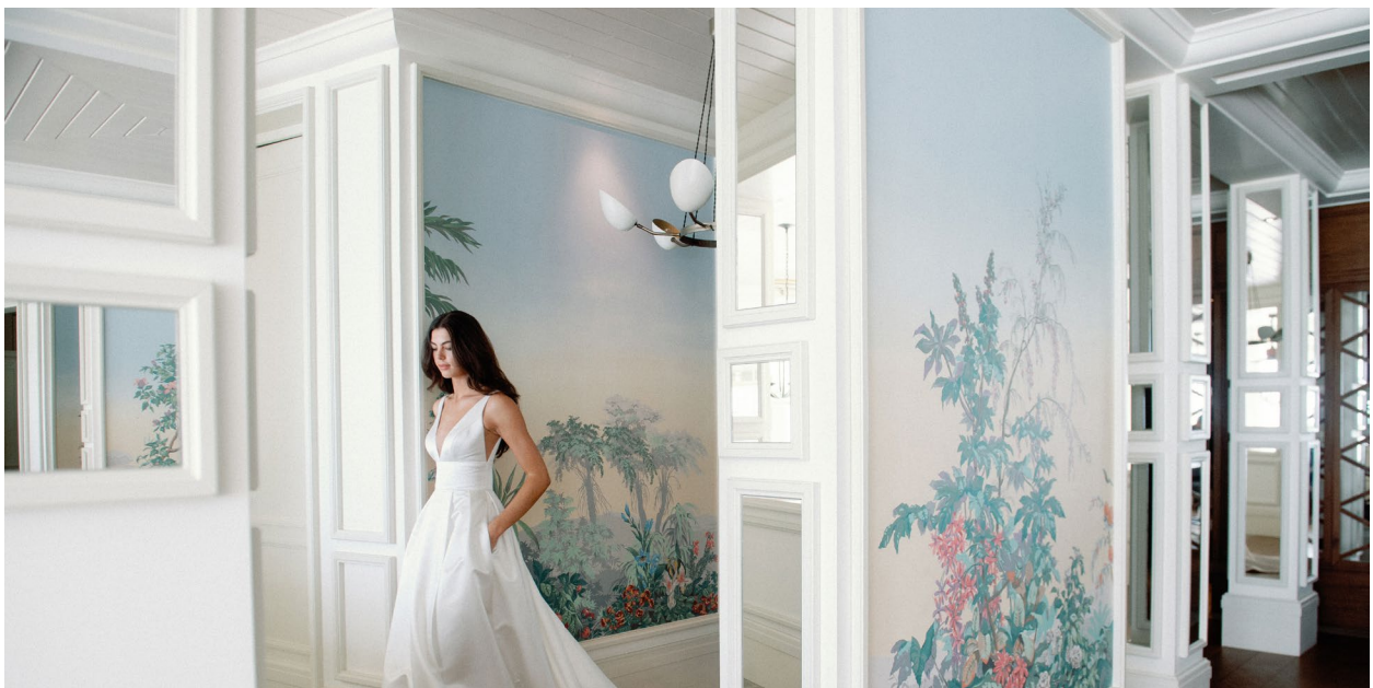
Tides Bar + Grill Available for events for up to 60 guests