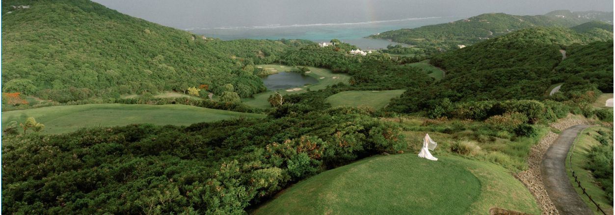
Signature Hole at Golf Course Available for cocktail hour and ceremonies for up to 20 guests