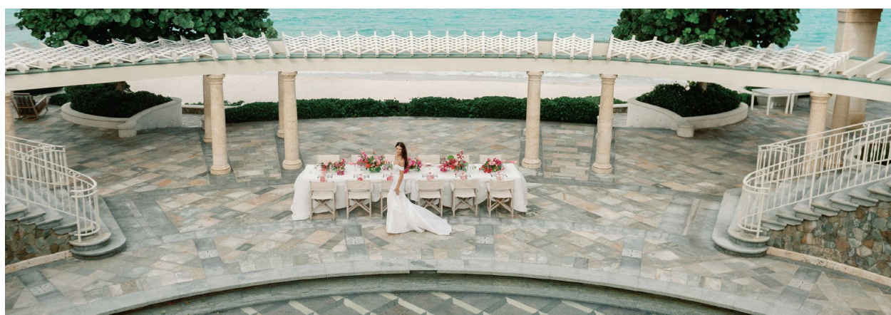
Crescent Court Available for events for up to 60 guests