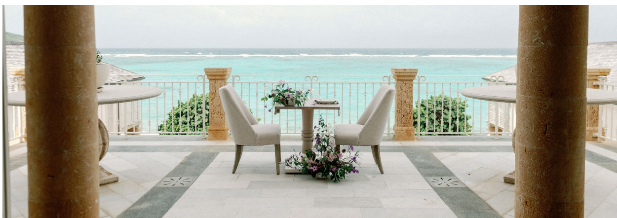
Tides Terrace Available for events for up to 50 guests