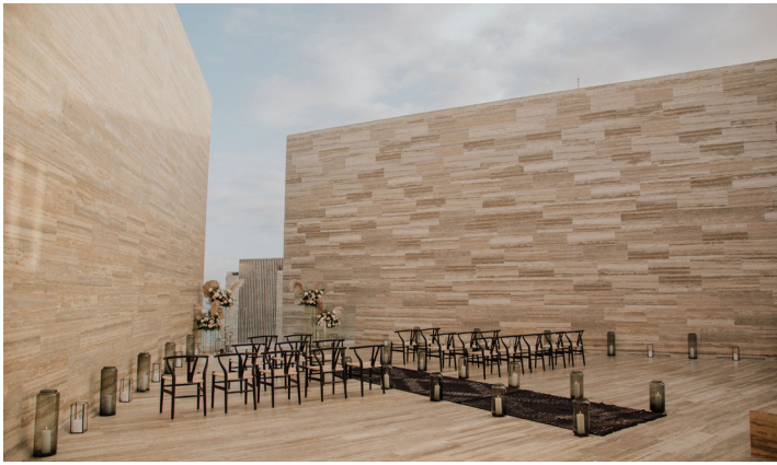
Blue Horizon Accomodates 2 - 30 guests