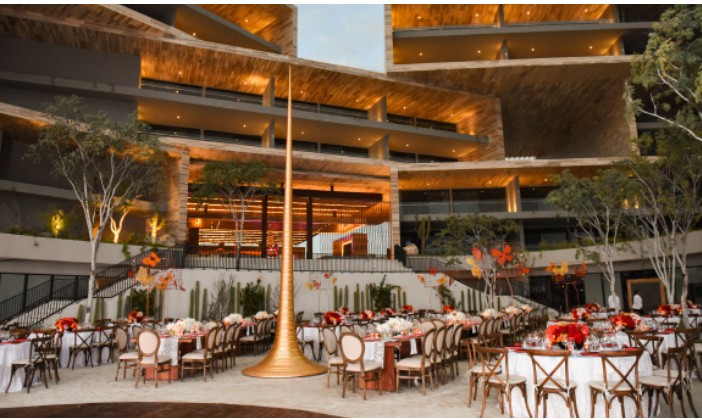
Plaza Solaz Accomodates 30 - 250 guests