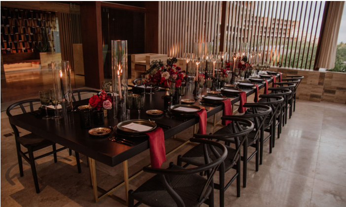
Cascabel Accomodates 40 - 90 guests