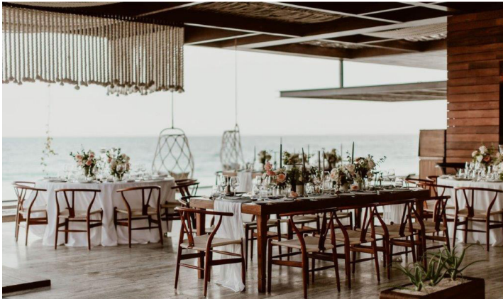
Mako Accomodates 30 - 60 guests