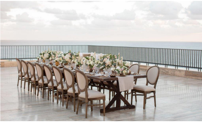
Horizon 33 Accomodates 2 - 30 guests