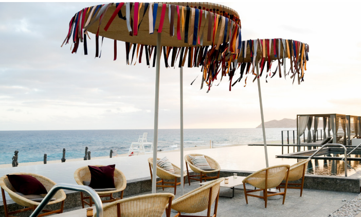
Pool Deck Accomodates 2 - 100 guests