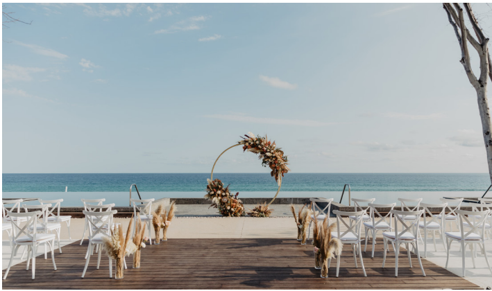
The Club Pool Deck Accomodates 2 - 100 guests