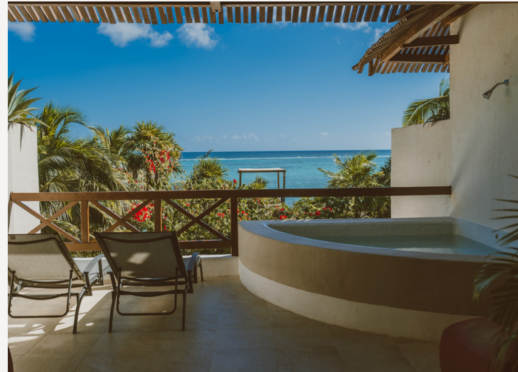
Tropical & Ocean Front