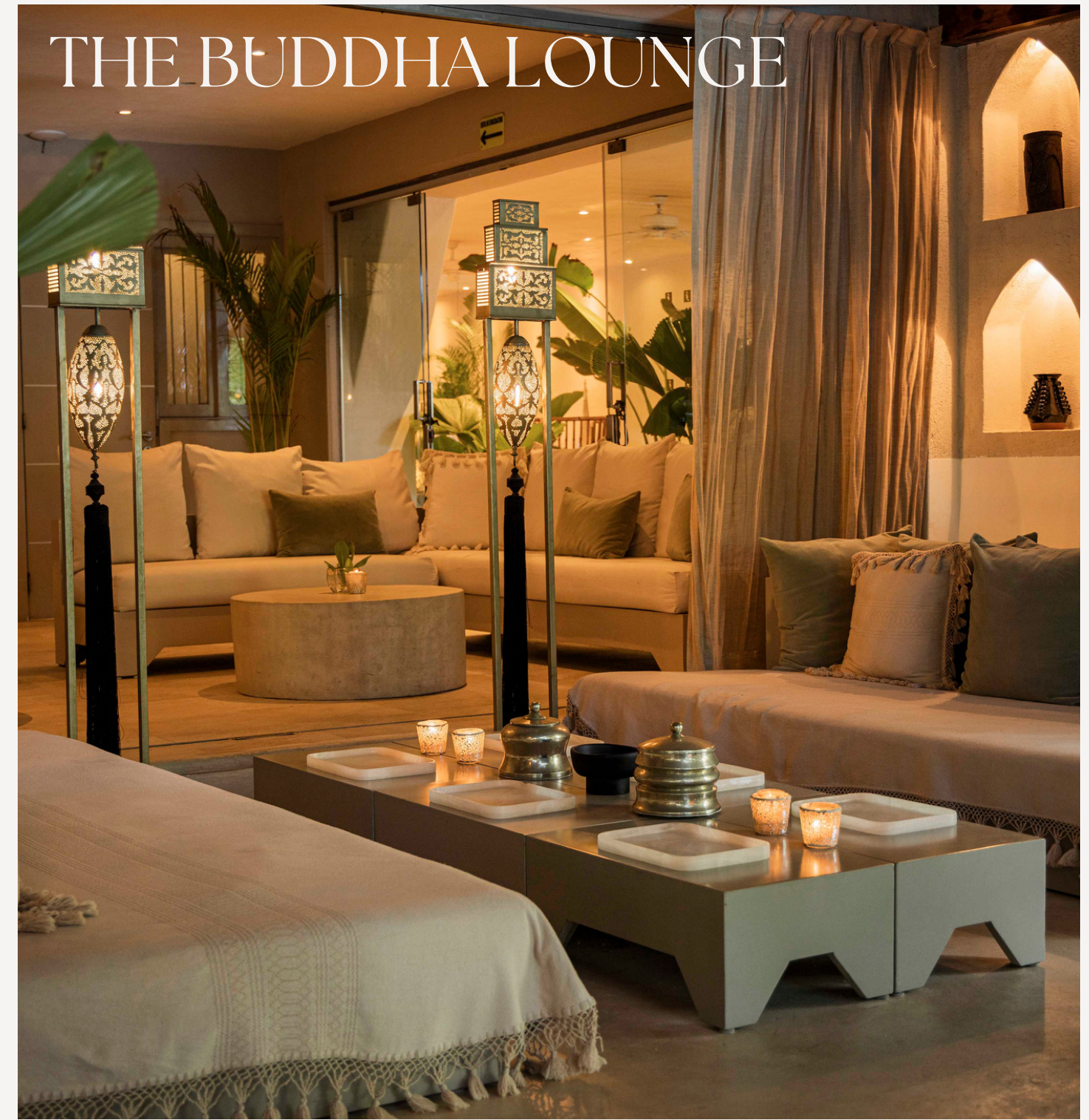
A stylish and tranquil lounge area at the heart of Jashita Hotel.