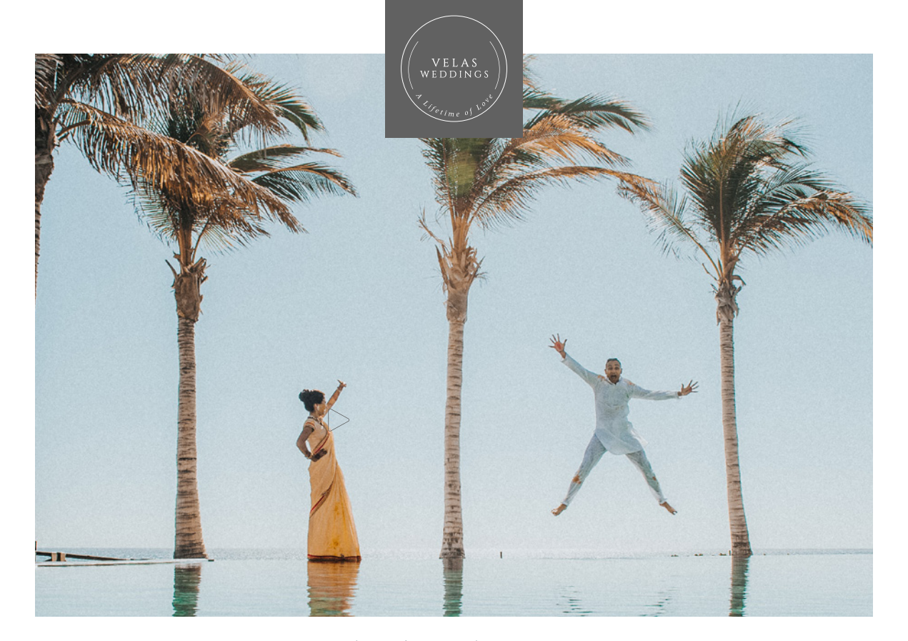
The Sky is the Limit!